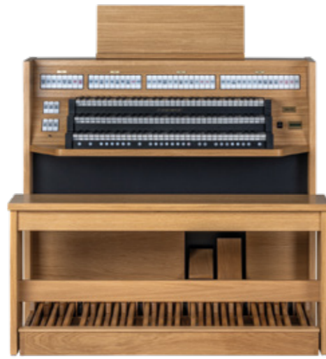
The Opus 360 A masterful organ for every organist

The Opus 260 features a style-variable disposition of 36 stops. The samples for these stops, which are divided into four organ styles, all come from recordings of famous pipe organs of churches in Kampen, Amsterdam, Raalte, Paris and Dresden. Playing an Opus 260, changing between these styles is done in the blink of an eye. Whether you play Bach, Mozart, or Guilman: the Opus 260 is all you need.