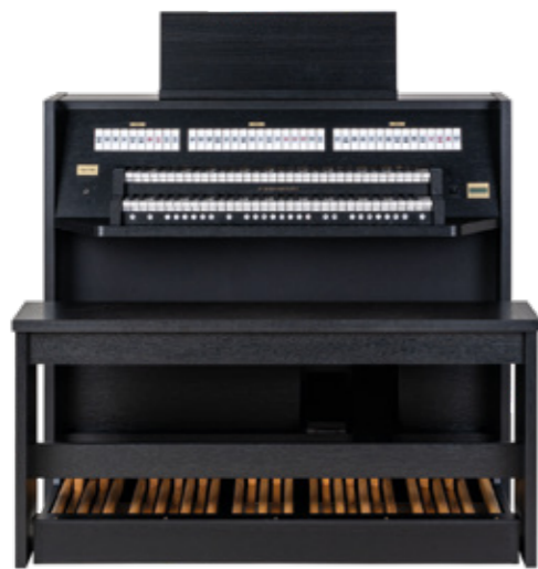
The Opus 260 The Opus 260 always sets the right tone

The Opus 260 features a style-variable disposition of 36 stops. The samples for these stops, which are divided into four organ styles, all come from recordings of famous pipe organs of churches in Kampen, Amsterdam, Raalte, Paris and Dresden. Playing an Opus 260, changing between these styles is done in the blink of an eye. Whether you play Bach, Mozart, or Guilman: the Opus 260 is all you need.